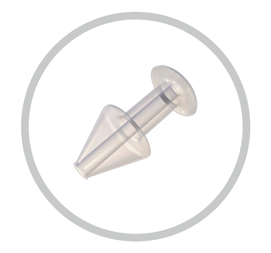
Partial Micro Flow<sup>™</sup>