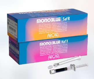
MONOBLUE Ultra-Purified Trypan blue solution