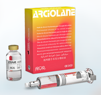
ARCIOLANE Fractionated and Purified Silicone Oil