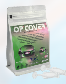
OP'COVER Corneal Protection

FOR COMPLETE PRODUCT INSTRUCTIONS, PLEASE REFER TO THE IFU SUPPLIED WITH THE PRODUCT