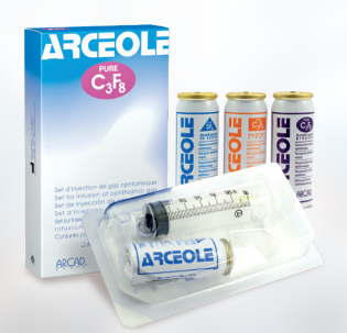
ARCEOLE Ready-to-Use Set of Ophthalmic Gas