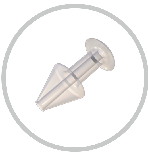
Partial Micro Flow™